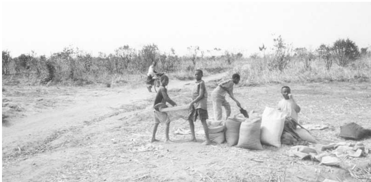
Young boys sieving heterogenite, Kolwezi, DRC, May 2004.

A similar situation can be seen in Lubumbashi, where people have complained about a large factory located in the heart of the city, and fear that radioactive materials from Shinkolobwe are being treated there 97 . In addition to high pollution and dust levels in these towns, the local population have expressed serious concern about water pollution in the region. A factory processing minerals has been installed on the Kipushi Road, on a site where the local water company are treating the water used by around 70% of the population of Lubumbashi. People fear their drinking water is becoming contaminated. 98 Local NGOs have complained to the government about this issue, but no action has yet been taken to address the situation.