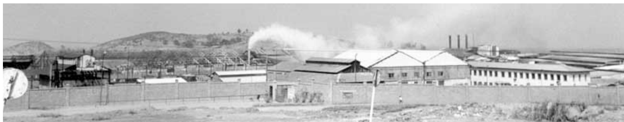
Shituru factory, Likasi, DRC, May 2004.

The result is a colossal contrast between the booming heterogenite trade and an area with a desperate population. Katanga was once the “jewel in the Congo's crown,” but has dramatically deteriorated over the past ten years. The collapse of Gécamines meant a rise in unemployment in the region, and also resulted in the closure of many schools and hospitals originally provided by the company for families of employees. Schools in the area lack funds to pay teaching staff and provide necessary equipment and the hospitals in and around Lubumbashi are now suffering from a serious supply shortage. A “brain drain” from the area has meant many of the doctors and professionals from Katanga have gone elsewhere in search of employment opportunities.