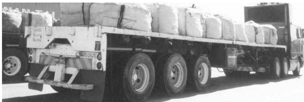
Truck in Johannesburg loaded with heterogenite from the DRC, May 2004.

Table 2 (below) illustrates the rising trend and high levels of China's imports of cobalt ores and concentrates from the DRC. In 2003 China imported almost 39,000 tonnes of cobalt ores from the DRC at a c.i.f. (import value) of approximately $24,118,000. 99 In the first five months of 2004 alone China has imported almost 22,000 tonnes, with a c.i.f value of over US$35,481,000. This is a stark illustration of the enormous revenues that could potentially be captured by the DRC but which are being lost due to an appalling lack of oversight of mining operations and revenue streams in the DRC.