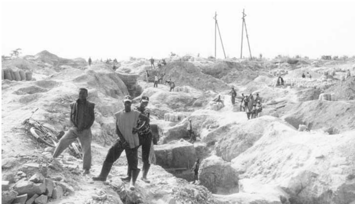
Artisanal mine, Kolwezi, DRC, May 2004.

the export of heterogenite from Katanga are not collected. While some information is filtering back to the Ministry from Alex Stewart International Corporation (the company appointed to assay (analyse) minerals exported from the DRC), this does not present a coherent picture of the quantities of minerals being exported and Alex Stewart International Corporation (ASIC) does not analyse all heterogenite being taken from the DRC. Instead, the Ministry of Mines advised Global Witness to approach the customs office for statistics or to look at import figures for China in order to get an idea of quantities leaving the DRC. 44