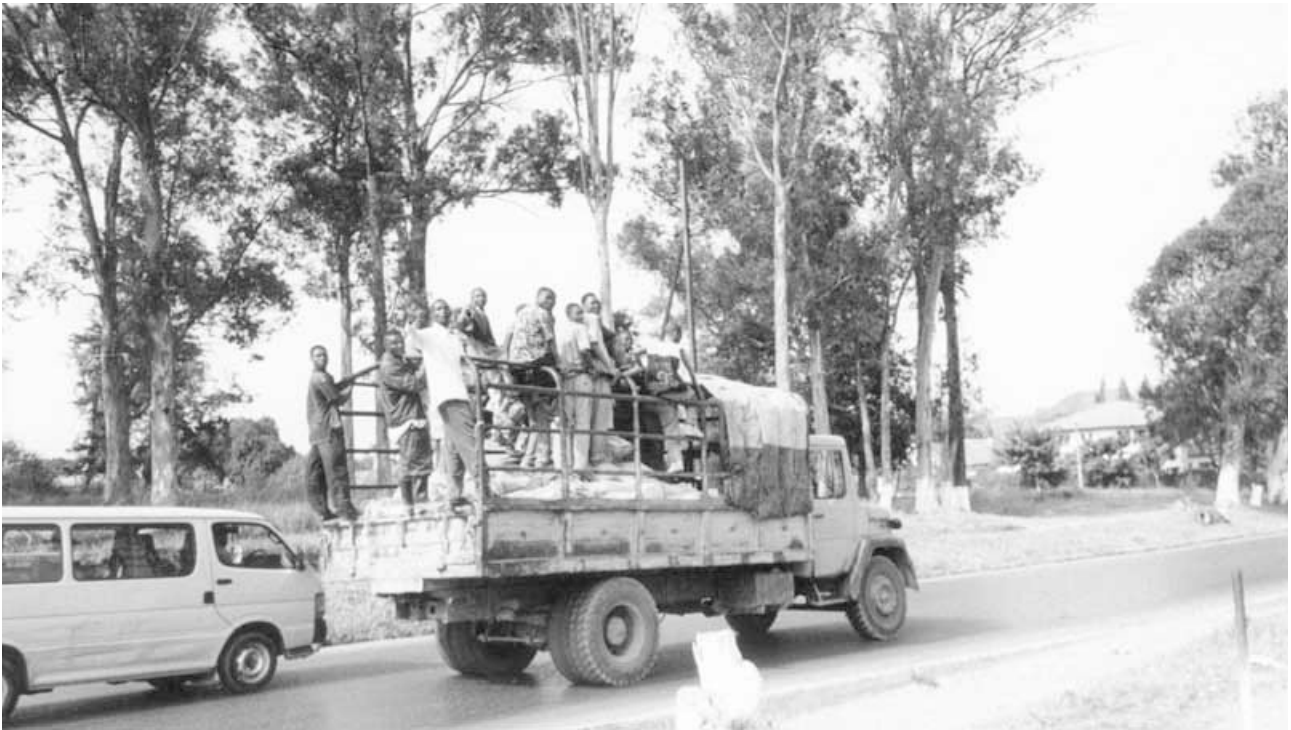
Truck transporting artisanal miners and heterogenite, Lubumbashi, DRC, May 2004.

heterogenite they receive arrives without a certificate from their partner office in Lubumbashi, and those certificates that do accompany the trucks are usually forged. 62 This indicates that companies are forging the requisite certificates themselves rather than paying ASIC for them in Lubumbashi.